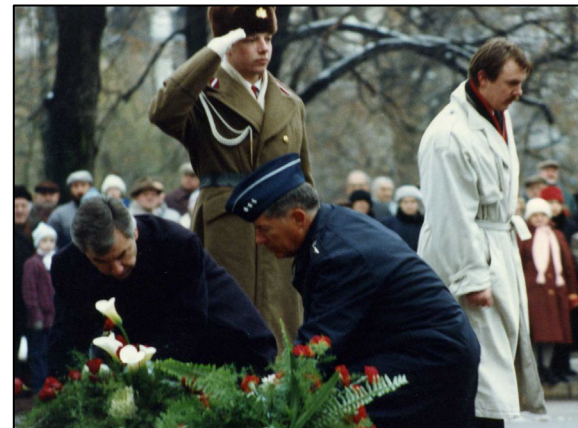
1992: Then-Chief of the NGB, Lt Gen John B Conaway, lays a wreath at the Freedom Monument in Riga, Latvia