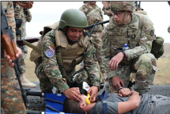
Kansas Army National Guard Soldiers conduct medical training with Soldiers from the Republic of Armenia during Exercise Eagle Partner Aug .2025