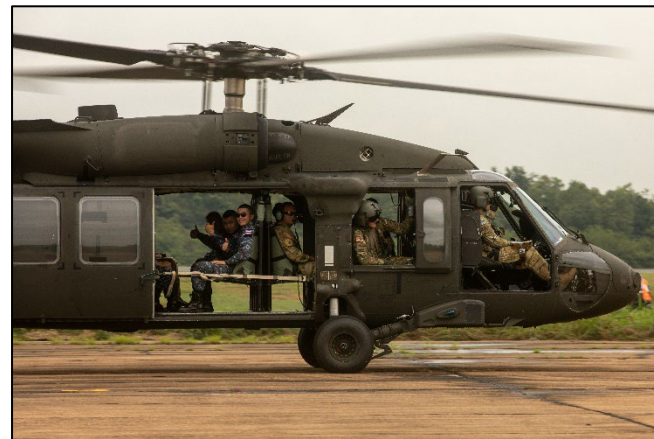
Royal Thai Air Force service members prepare for takeoff on a Washington National Guard UH-60M Black Hawk helicopter as part of Enduring Partners 2025 at Korat Royal Thai Air Force Base, Thailand,